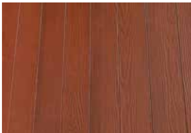
Merbu / Exterior water based varnish stain

Duragroove™ Wide and Extra Wide Profiles add flexibility to the design of any facade. The shiplap joint makes it easier and faster to install and our offer of 3 sheet sizes helps reduce costly wastage.