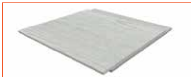
A 300mm wide plank