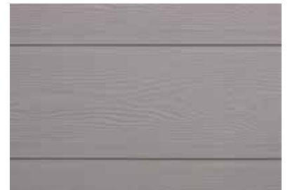
Windspray / Acrylic water based paint