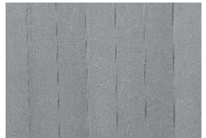
Woodland Grey / Acrylic water based paint