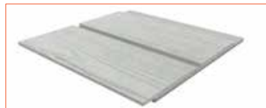
A 300mm wide plank with a 16mm groove in the centre giving the appearance of 2 thinner planks