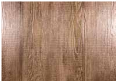
Spotted Gum / Exterior water based varnish stain

Stratum™ is a vibrant and innovative alternative to traditional weatherboards and now with a timber texture you have the best of both worlds – the longevity of Fibre Cement and the character of timber. The deep shadow line creates a contemporary aesthetic with two groove options to choose from.