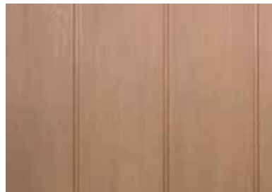
Cedar / Exterior water based varnish stain