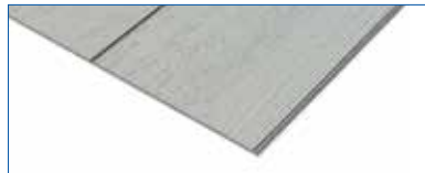
A vertically grooved panel with 400mm between the grooves