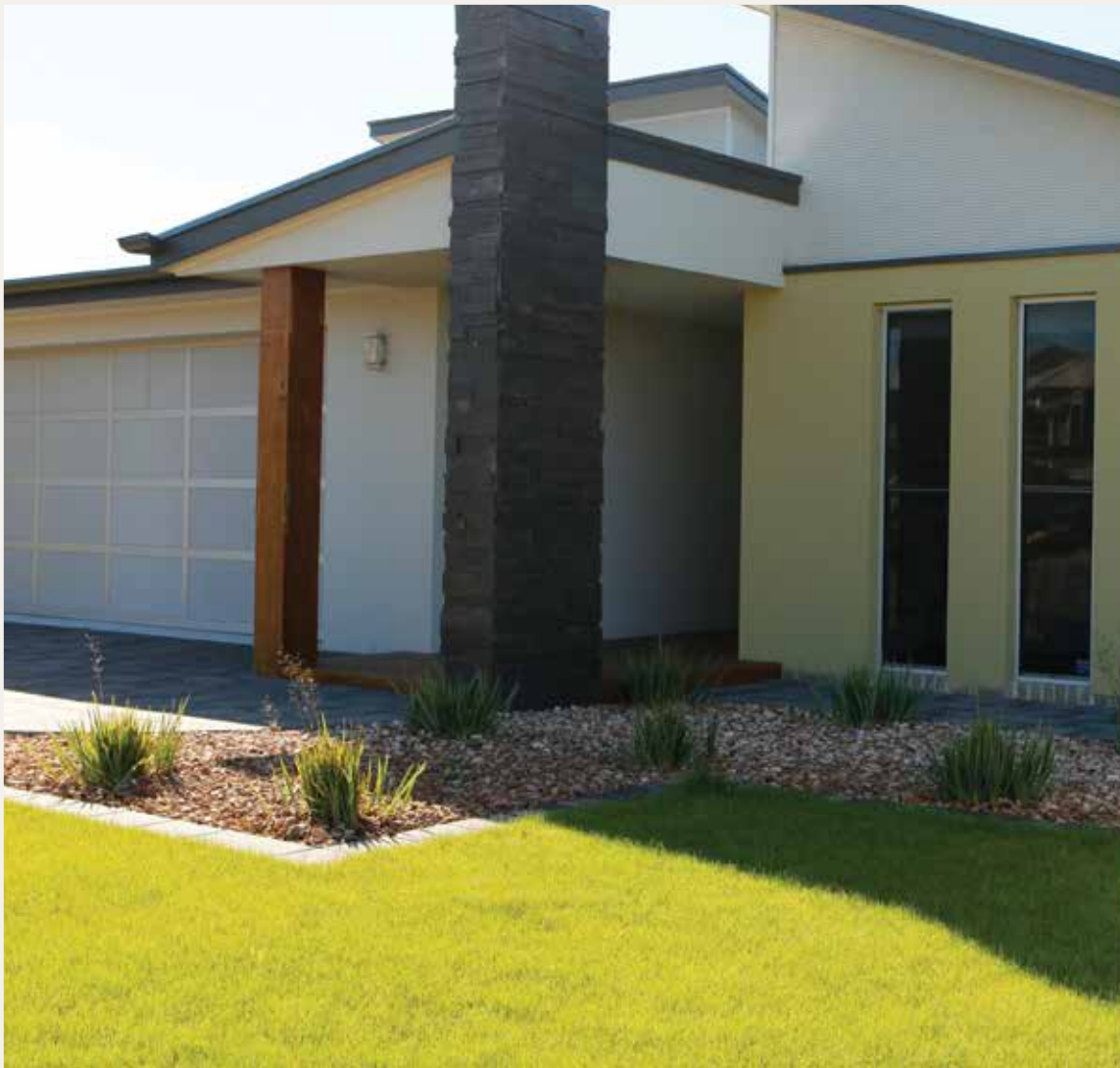
01 // 02 EXTERIOR