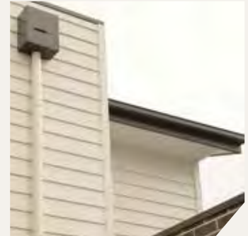
02 EXTERIOR CROP

BGC PRODUCTS UTILIZED COMPRESSED FIBRE CEMENT DURATEX™ DURALINER™ DURALATTICE™