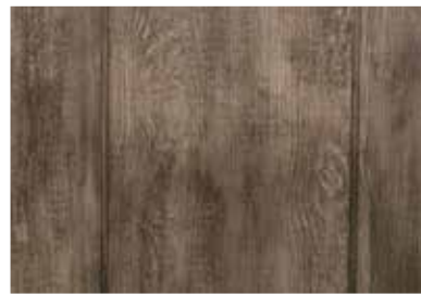
Charcoal / Exterior water based varnish stain